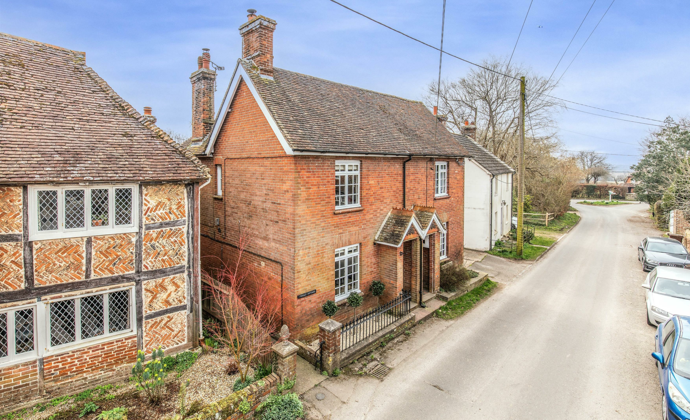
1 Tingley Cottages The Street, Ripe, Lewes, BN8 6BD